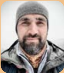
Dan Dinu dandinu.net

Jury For the current edition of the competition the members of the jury are the following photographers: