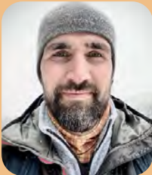
Dan Dinu dandinu.net

Jury For the current edition of the competition the members of the jury are the following photographers: